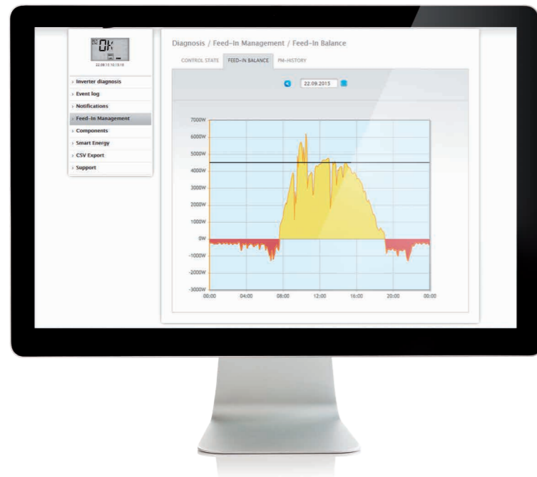
Feed-in management - feed balance: The times when there was a grid feed and when electricity was purchased from the grid can be seen at a glance in this graph. Negative (red) values indicate that electricity was purchased from the grid and positive (yellow) values that there was grid feed.

When used with the Solar-Log WEB Enerest™ XL and either the SCB or SMB, the Solar-Log 2000 monitors every single string, ensuring the most complete and secure monitoring for large-scale PV plants with exact error identification and localization.